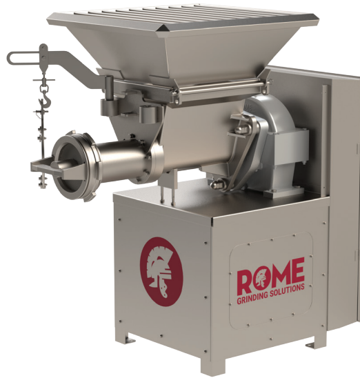
Shown: Titan 1107

The Titan grinder leads the way in versatility, backed by Rome's trademark design and durable Made in the U.S.A construction. Able to accommodate a wide variety of fresh food products, the Titan helps industrial food producers decrease downtime and increase daily production yield with minimal parts.