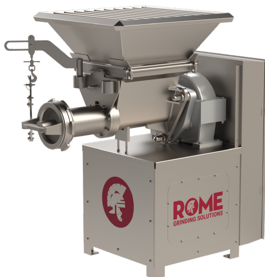
Shown: Titan 1107

The Titan grinder leads the way in versatility, backed by Rome's trademark design and durable Made in the U.S.A construction. Able to accommodate a wide variety of fresh food products, the Titan helps industrial food producers decrease downtime and increase daily production yield with minimal parts.